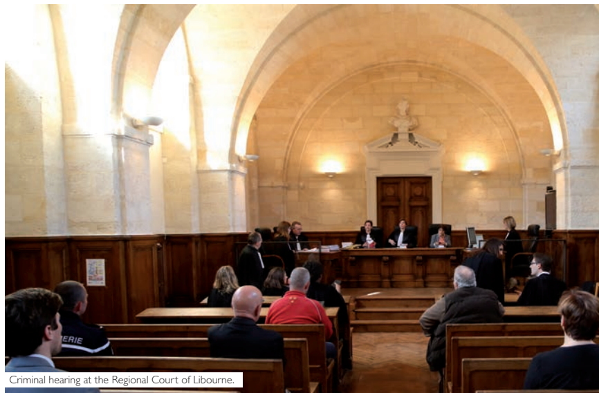
Criminal hearing at the Regional Court of Libourne.

Firmly focused on practice, this training session will alternate between presentations, case studies, dialogue, and mock hearings. Led by judges and prosecutors well versed in criminal hearings, it will focus on the skills and techniques necessary for effective management, while incorporating the views of other judicial actors (especially lawyers). Participants will also attend one or more criminal hearings.