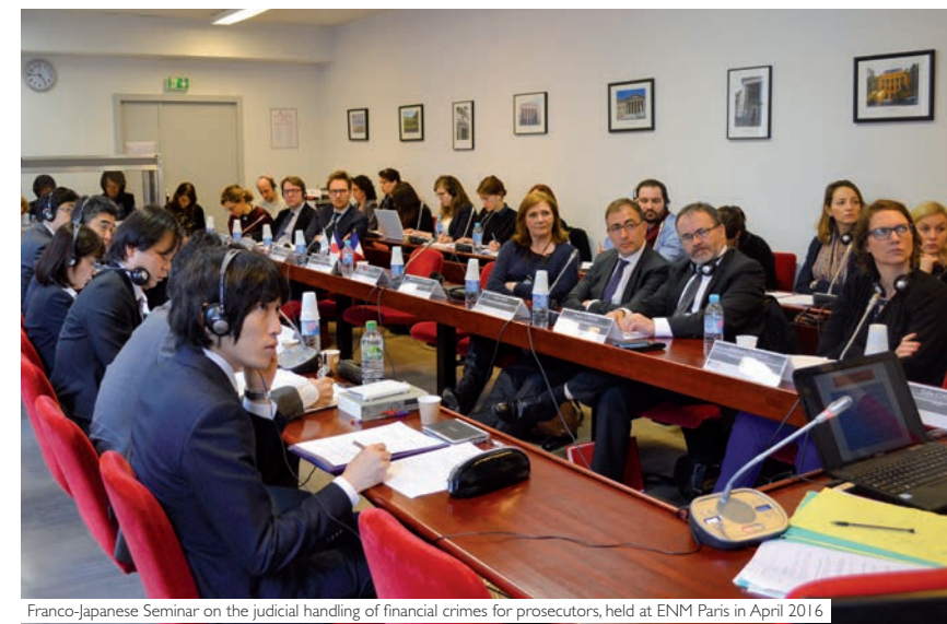
Franco-Japanese Seminar on the judicial handling of financial crimes for prosecutors, held at ENM Paris in April 2016