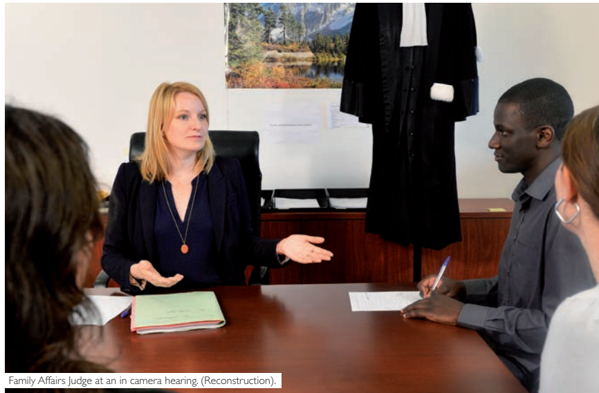
Family Affairs Judge at an in camera hearing. (Reconstruction).

A phenomenon that is universal but has only recently been acknowledged, domestic violence constitutes a type of dispute that courts are now facing more and more frequently, with cases that involve diverse and complex mechanisms. They require an accurate assessment of the behaviour of those concerned in order to adapt the judicial response appropriately and prevent recurrence. This session presents the information needed to gain better understanding of this violent behaviour and to ensure an appropriate multi-disciplinary response. Aside from studying the French legal framework, the sociological and psychological dimensions behind these acts of violence will also be examined, as well as the phenomenon of influence and the position of the victims. The procedures for legal, social and therapeutic treatment applied in France will be analysed and discussed as well.