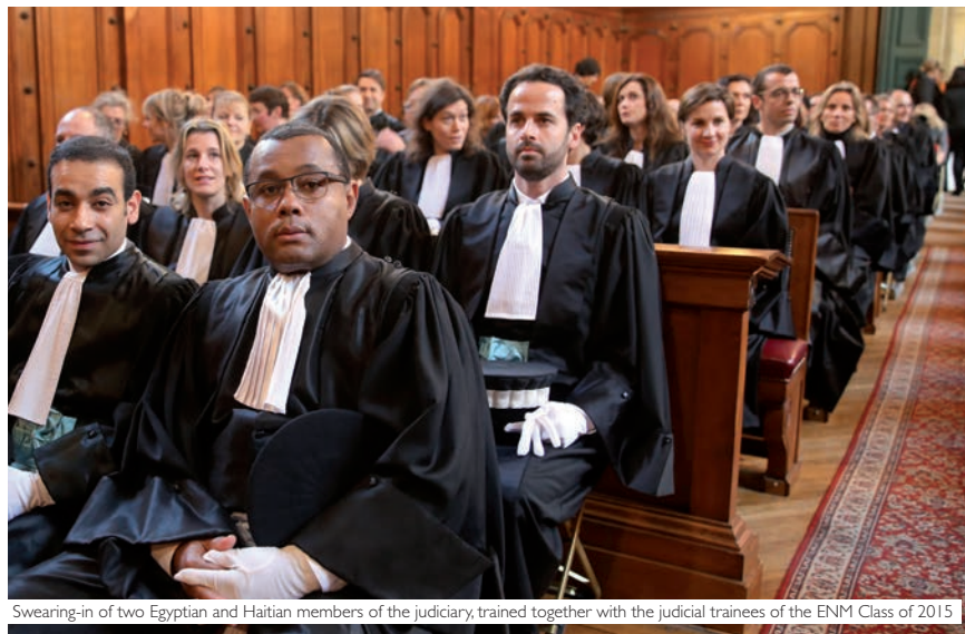
Swearing-in of two Egyptian and Haitian members of the judiciary, trained together with the judicial trainees of the ENM Class of 2015.

From the School's beginnings, overseas judges and prosecutors were offered the opportunity to take the initial training cycle in France, in a special "international class" at the National School for the Judiciary. Since 2006, present or future judges and prosecutors from abroad have been integrated into the intakes of the School alongside French students. With the exception of the internship abroad and the placement in a law firm that French trainees must complete at the start of their training. Foreign students follow the whole of the course: the class work in Bordeaux, the court internship and the outside internships with partners of the justice system. They take all the evaluation papers (except for the ranking examination), and if they complete their studies successfully, the School issues them with a diploma.