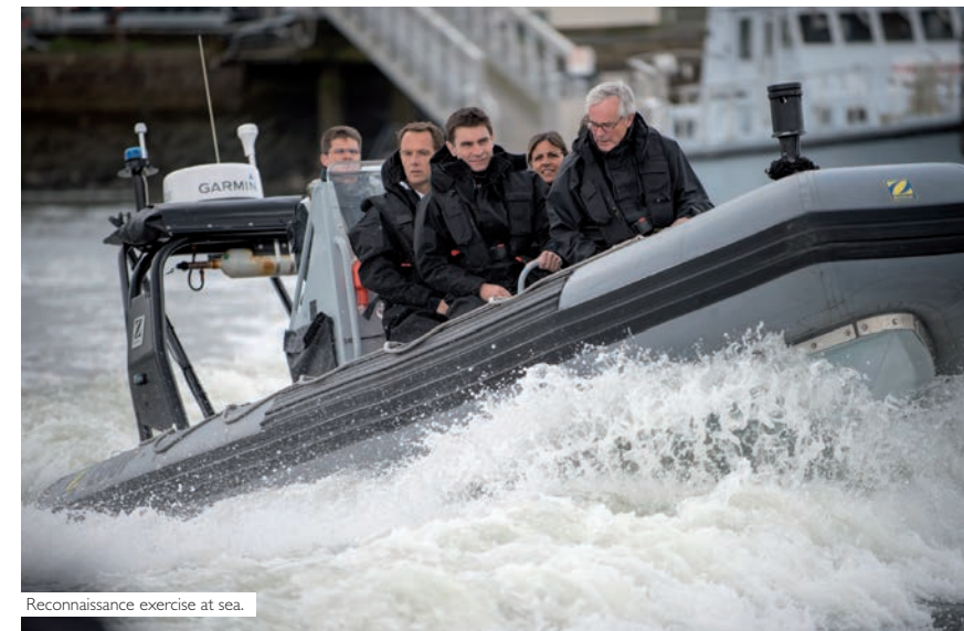
Reconnaissance exercise at sea.

This training session is dispensed by specialists in environmental law and provides broad and practical course content on the subject for prosecutors and judges. It presents all the different players likely to be involved in such matters, as well as the systems and terms of effective processing of offences.