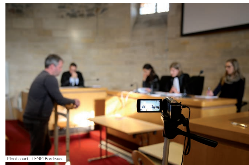
Moot court at ENM Bordeaux.