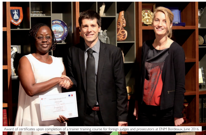
Award of certificates upon completion of a trainer training course for foreign judges and prosecutors at ENM Bordeaux, June 2016.

Complete and largely electronic documentation in French on all the subjects and techniques addressed during the course is supplied to participants.