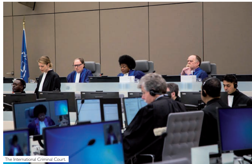
The International Criminal Court.

Organised in partnership with the Institut des Hautes Études sur la Justice (IHEJ; Institute for Advanced Studies in Justice) and essentially multidisciplinary in nature, this training course will involve the participation of judges, prosecutors, court clerks and investigators in the field of international criminal justice, and lecturers such as historians, sociologists or political scientists.