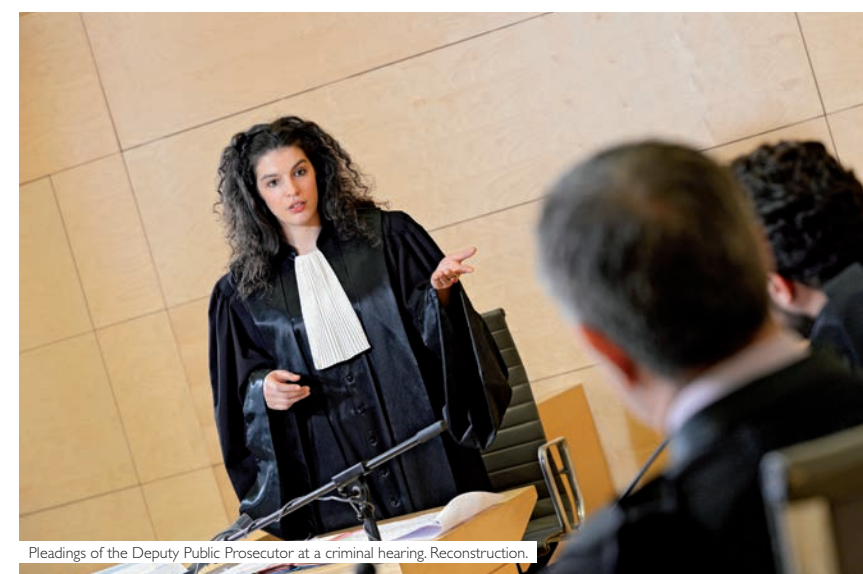
Pleadings of the Deputy Public Prosecutor at a criminal hearing, Reconstruction.

Participants will see the handling of cases and criminal hearings in real time during a visit to a major prosecutor's office in the Paris region and will get an insight into French prosecution practice through practical cases.