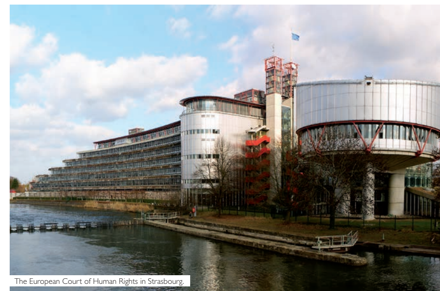
The European Court of Human Rights in Strasbourg.

Since the entry into force of the Lisbon Treaty on 1 st December 2009, the Charter of Fundamental Rights of the European Union has become a binding legal document. The European Union has also been recognised as having the capacity to sign up to the European Convention on Human Rights. In addition to this, since 1 st June 2010, Protocol 14 has introduced profound changes to the workings of the European Court of Human Rights (Court reorganisation, single judge, modification of application admissibility criteria, decision enforcement...). Judges and prosecutors may be required to reflect on the relationships between the Convention and the Constitution within the framework of priority preliminary rulings on the issue of constitutionality. These different changes make this a session of great interest for participants, allowing them to revise or gain more thorough knowledge essential to the exercise of their duties.