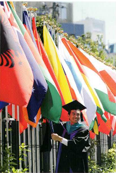
GRIPS attracts students from around the world in a variety of fields. Networks established during study are precious assets after graduation. Our graduates number over 4,500 and hail from 115 different countries and regions, including those from GRIPS's predecessor, the Graduate School of Policy Science (GSPS) at Saitama University.

Many students at GRIPS are mid-career personnel from central and local government, related institutions and private companies. About 60% of the student body is composed of international students from nearly 60 countries and regions, many of whom are administrative officials in their own countries. Our students have diverse nationalities, cultures, and languages, but they are all dedicated policy professionals. GRIPS is an environment where Japanese and international students can address the same problems in the same classroom, thinking about future policy from a global perspective.